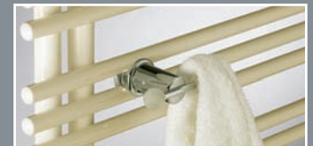
Double Robe Knobs: Available in chrome with frosted glass knobs.