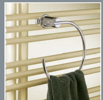
Towel Ring Available in chrome.