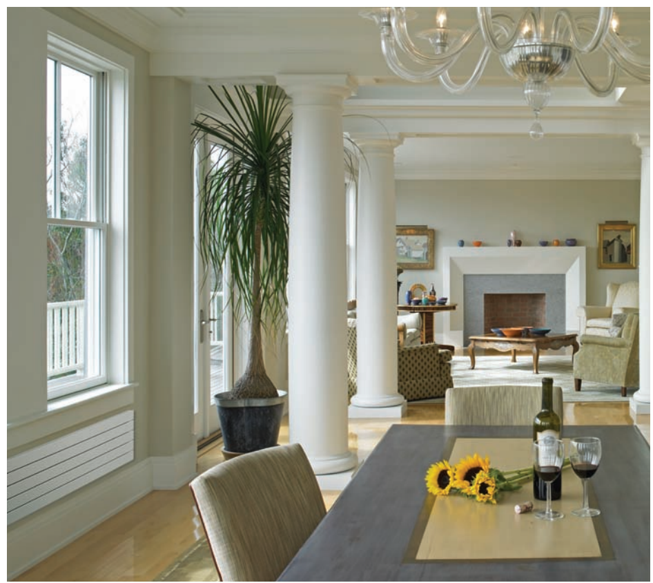
Runtal's Wall Panel style radiators are ideal for placement under windows or on walls where floor space is at a premium. When placed under windows, wall panels help eliminate cold spots and drafts while allowing curtains to hang to the floor. Wall panel radiators are available in a variety of heights and widths to suit most any need.