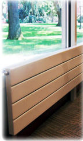
RF Quick Overview