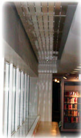
RC Quick Overview