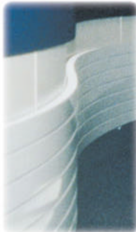
CURVED RADIATORS Quick Overview