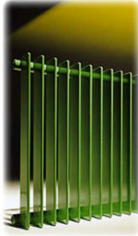
RS2 Quick Overview