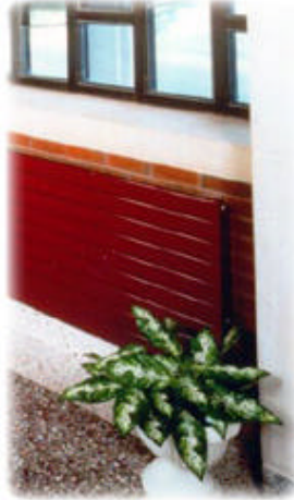
R Quick Overview