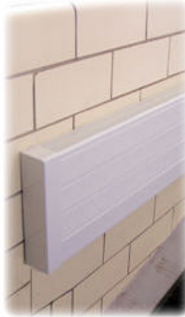
THERMOTOUCH Quick Overview