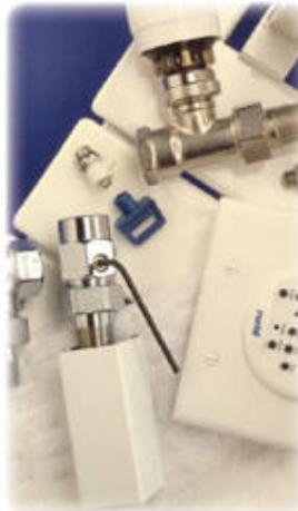
ACCESSORY PRODUCTS Quick Overview