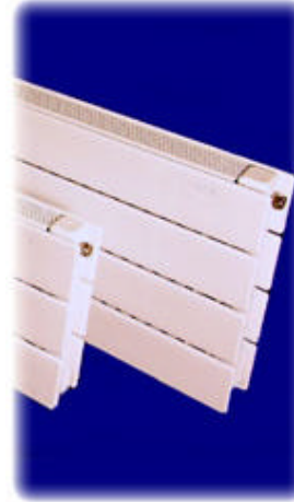
UFLT Quick Overview