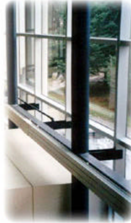
R2F Quick Overview