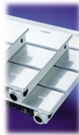
IN-STOCK RADIATORS Quick Overview

Comfort, Style, Energy Efficiency, Versatility, & Durability are all engineered into every radiator that Runtal builds. No surprise there, since Runtal invented panel radiators back in the 1950's; and Runtal's state of the art manufacturing facility at Ward Hill, MA is a world leader in Radiator Technology and Specialty Design. Runtal's flattened steel tube design provides maximum radiant comfort in a space-saving design, which allows Runtal to be integrated as part of the architectural scheme, rather than being tacked on to it.