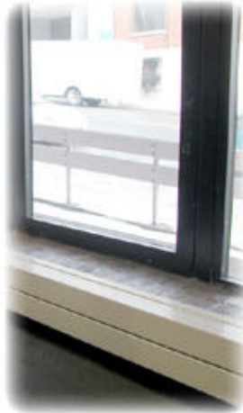
R3F Quick Overview